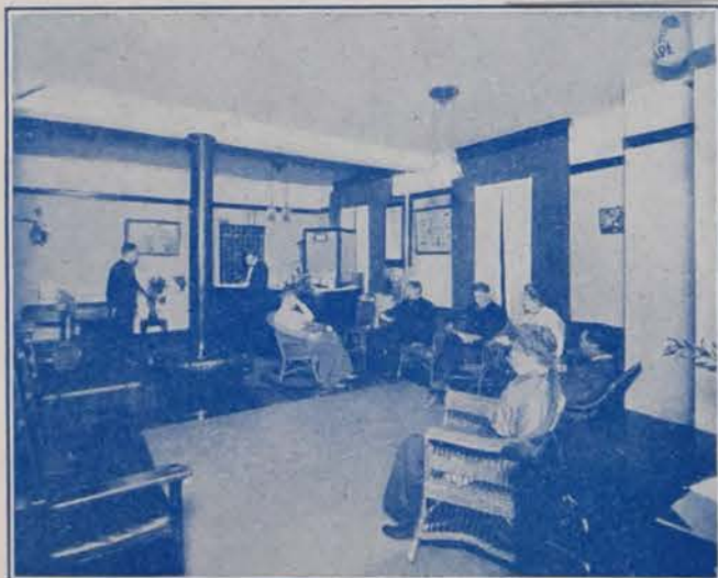
A VIEW OF THE LOBBY