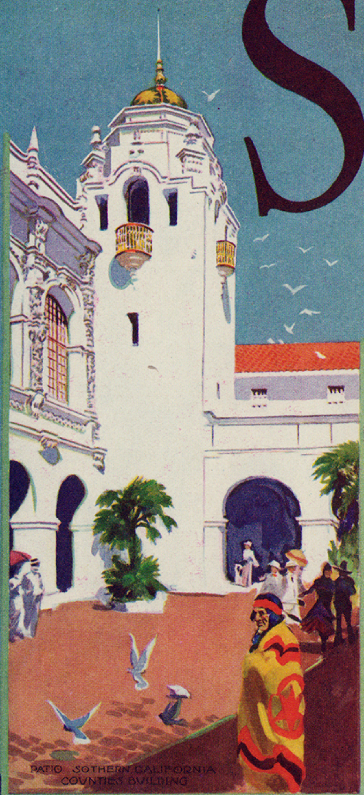
PATIO SOUTHERN CALIFORNIA COUNTIES BUILDING