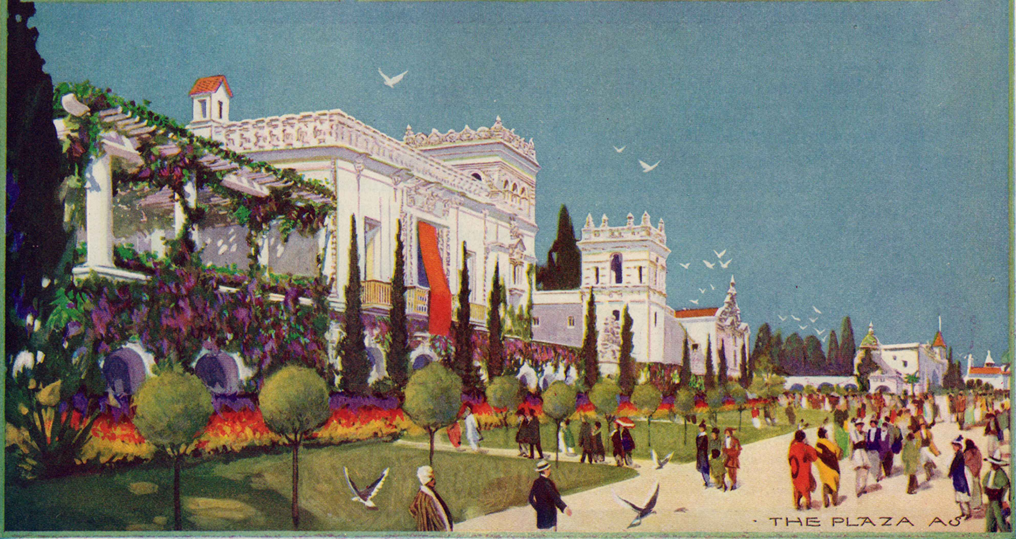
THE PLAZA AS IT APPEARS TODAY