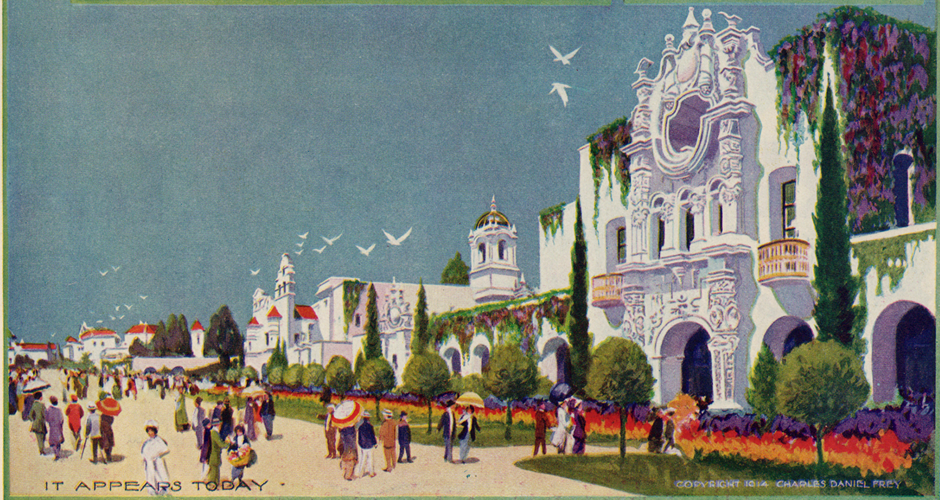
IT APPEARS TODAY