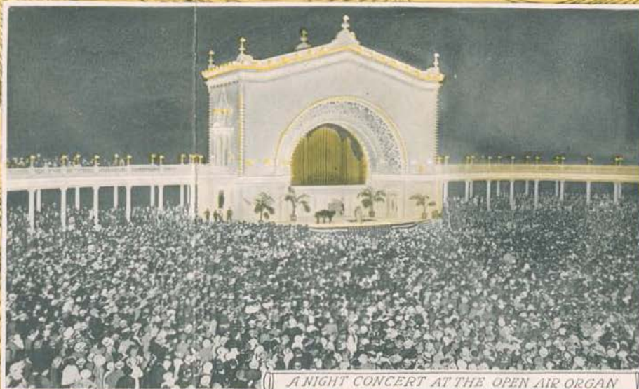
A NIGHT CONCERT AT THE OPEN AIR ORGAN

The continuation of this Exposition through 1916 is largely due to the public spirited and generous support of the people of Los Angeles, San Diego's metropolitan neighbor on the North. Recognizing the merit of the project and its value to all of Southern California, prominent men of affairs in that city volunteered to assume part of the responsibility for its maintenance and management for a second year. They raised a guarantee fund to insure its success and nine of them were elected to the Board of Directors where, together with their San Diego confreres, they are working earnestly and intelligently to make the new International Exposition a still greater success.