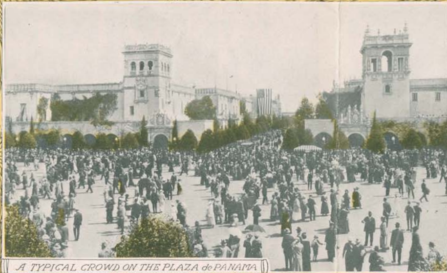
A TYPICAL CROWD ON THE PLAZA de PANAMA

A FTER an interval of ten weeks following the close of San Diego's 1915 Exposition, the new 1916 Panama California International Exposition, greatly enlarged, and augmented by the addition of many important exhibits and features of the San Francisco Exposition, was formally dedicated on March 18th in the presence of an enthusiastic multitude, greater in number than any crowd of the previous year.