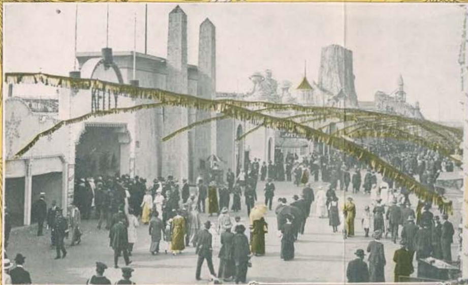
LOOKING DOWN THE ISTHMUS

The United States Government has given cordial support and has installed several exceedingly interesting exhibits. The Pan-Pacific Countries have been enthusiastic participants from the first. The various sections of California have spent large sums on the installation of suitable exhibits and the County buildings and displays add much to the value of the educational aspect of the Fair.