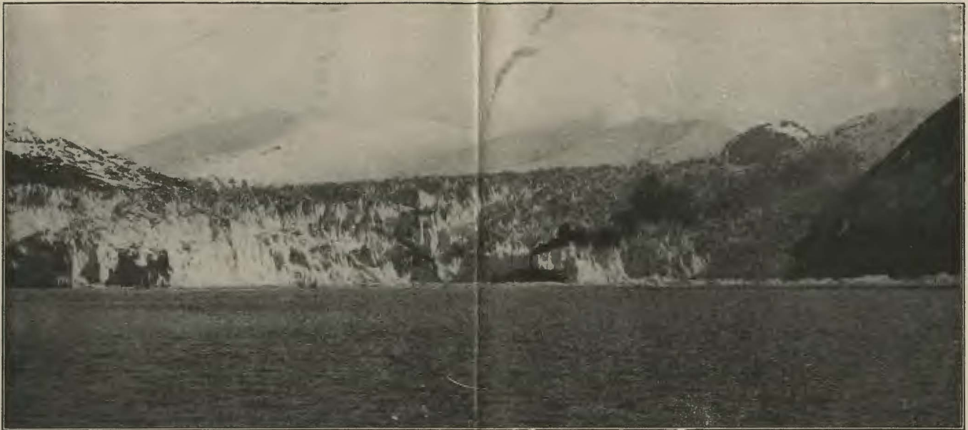
PACIFIC COAST EXCURSION STEAMSHIP AT TAKU GLACIER, ALASKA

Taku Glacier is a moving river of solid ice 200 to 300 feet high, over a mile wide, miles long, and of an intense blue color that no other glacier possesses. Great icebergs break from the front continually. Every cruise and excursion of the Pacific Coast Steamship Company to Alaska visits this glacier.