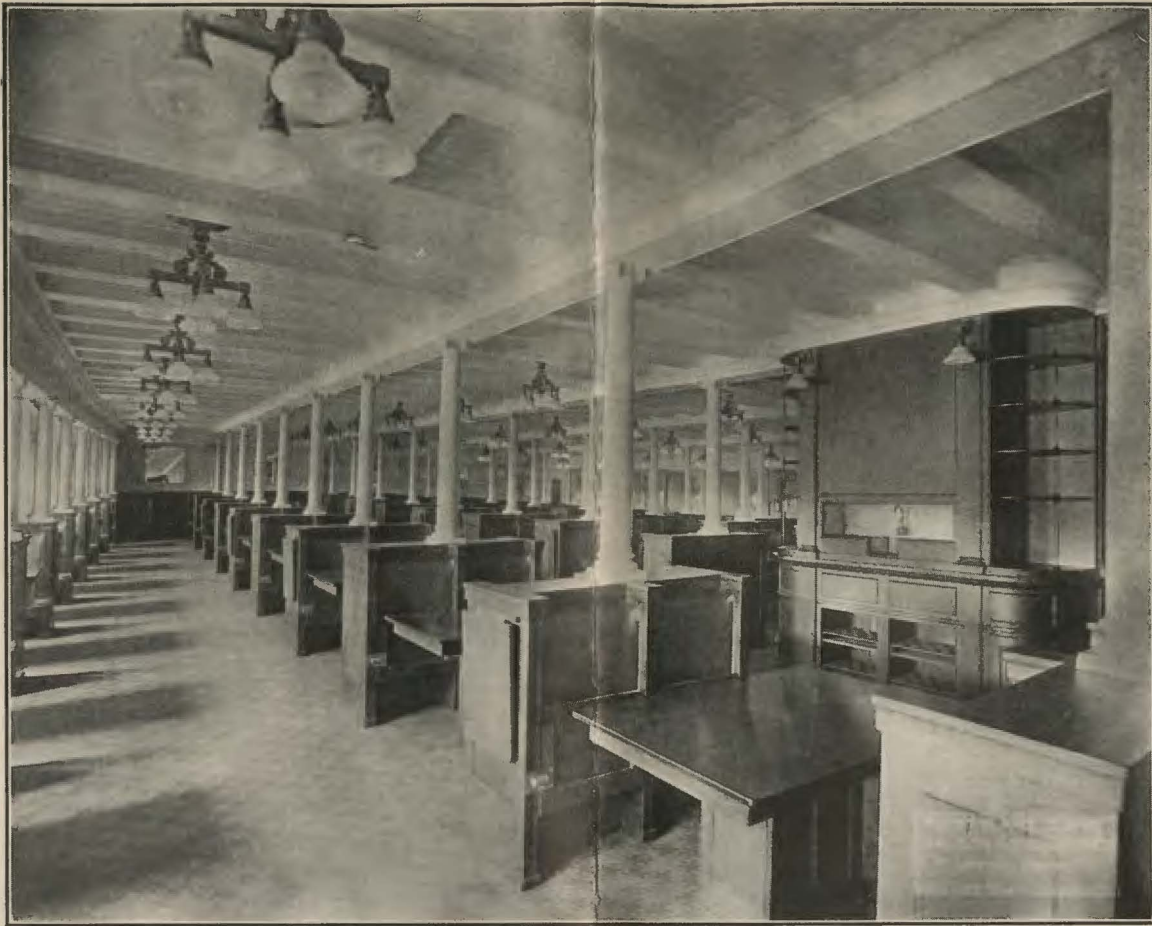
THERE'S ROOM FOR HUNDREDS AT ONE TIME IN THE SPACIOUS DINING SALOON OF THE LUXURIOUS PACIFIC COAST STEAMSHIP "CONGRESS"

Accommodations on steamships "PRESIDENT," "GOVERNOR" and "CONGRESS" are comparable only with the best hotels. Sea travelers holding first cabin tickets are without extra cost provided with a comfortable berth in a first cabin stateroom that is supplied with toilet accommodations, lighted by electricity, and provided with call-bell for service. These cabins are steam-heated on steamers "PRESIDENT" and "GOVERNOR," but heated by electric radiators on steamer "CONGRESS." Travelers also have free use of the large and beautiful social hall, and for men there is a comfortable buffet smoking room. The steamers have well-selected free libraries; by wireless telegraph there is constant possible communication with the world at large; bath-room privi-