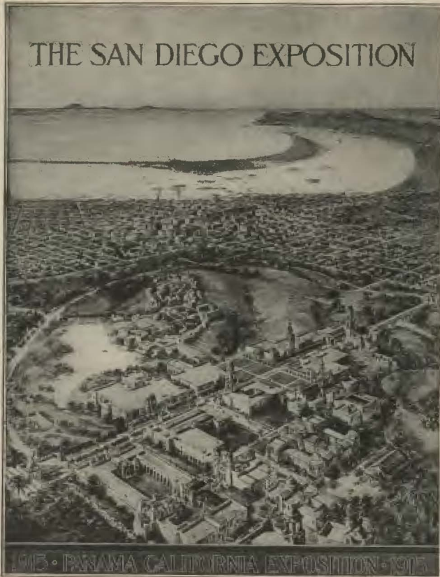
THE EXPOSITION, THE CITY, THE HARBOR AND THE SEA

"When I am dead and in my grave, No more sunshine will I crave; Living, I hope I can and may go To sun myself in San Diego." —Sunny Songs of the South.