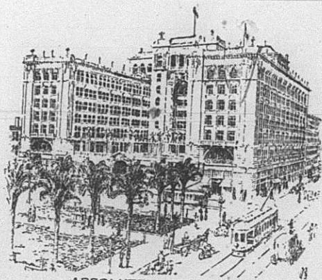
ABSOLUTELY FIRE PROOF